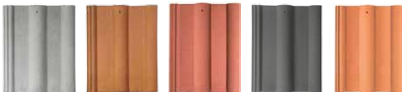
Victorian Grey 901061 Brown 901021 Red 901011 Slate Grey 901031 Terracotta 901041