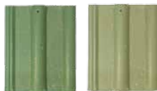
Moreland Green 901077 Green 901097