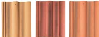
Kalahari 901053 Red 901013 Terracotta 901043